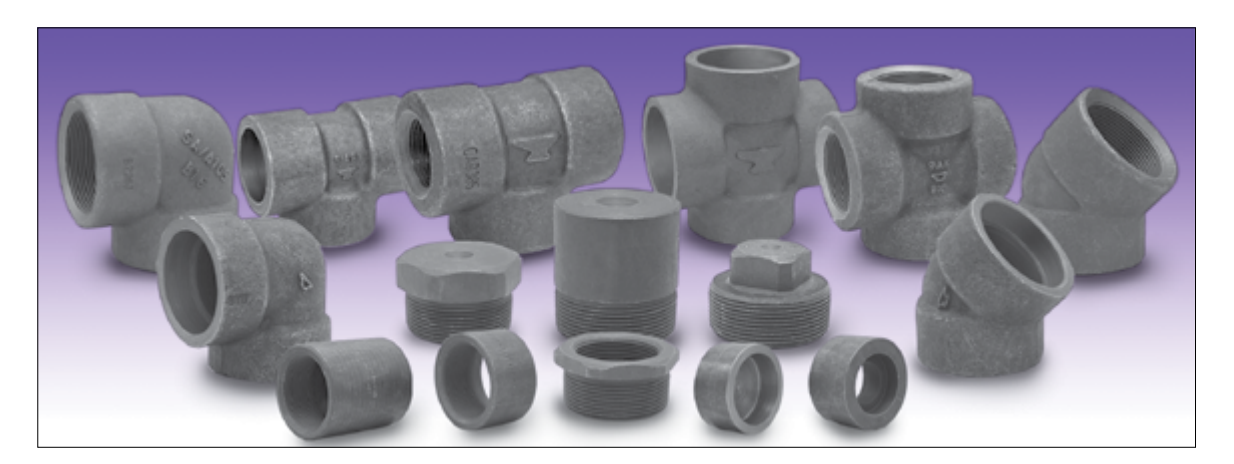
Fig. 2111 90° Elbows Fig. 2112 45° Elbows Fig. 2114 Tees